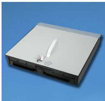
Transfer Cash and Media Securely with an Optional Locking Lid