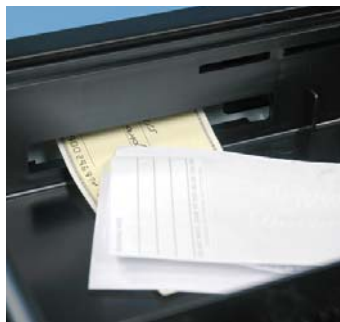
Large Flexible Storage Area Under the Coin Section