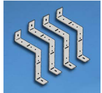
Easily Mounts Under the Counter with Optional Universal Brackets