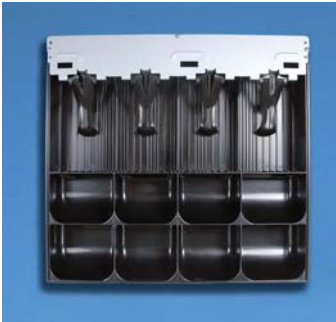
4 Bill / 8 Coin Insert Tray Available for Foreign Markets