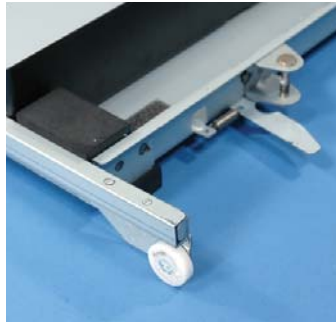
Steel Side Rails with Heavy Duty Nylon Rollers